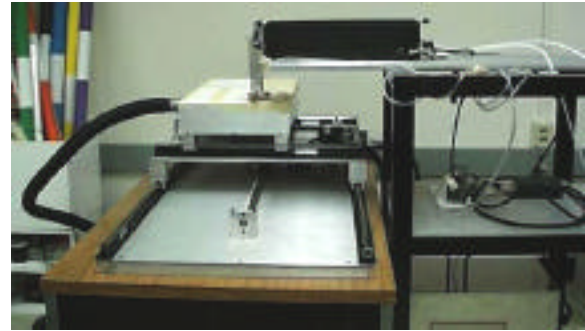
Figure 2. The cam being cut from basswood on a CO 2 laser cutter.

We believe that it is worth dwelling for a moment on the implications of the scenario in the previous section. Output is not merely an afterthought to computation, as the term “peripheral” might suggest. The fact that new