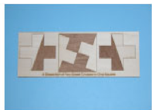
Figure 1. Three laser-cut mathematical displays. At top, an acrylic linkage demonstrates how to draw a lemniscate. At center, a "proof without words" [11] in acrylic. At bottom, a wooden display of a geometric dissection producing a square from two Greek crosses.

Fabricated objects can change educational settings, enabling those settings to evolve with children's (or, in some cases, teachers') interests and skills. Even traditional educational graphics or displays can be re-imagined with the aid of these new devices. Consider, for instance, the objects shown in Figure 1: the first is a