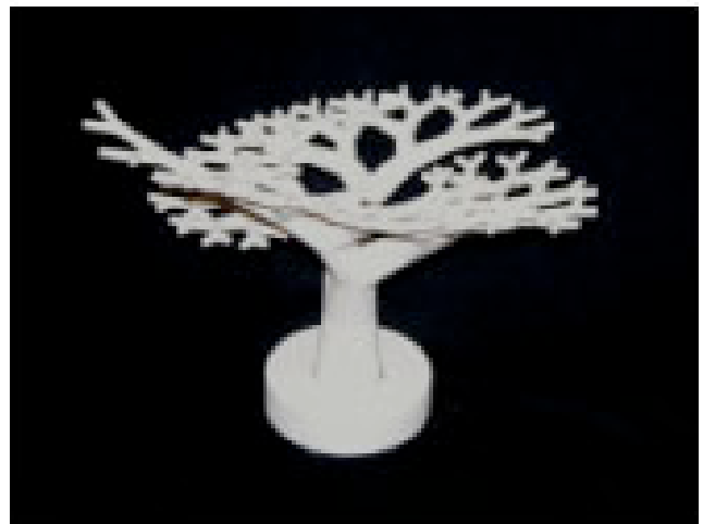
Figure 4. A plaster model of a tree, originally designed on the computer screen and then output to a 3D printer. [1]

Physical fabrication enriches a software-based constructionist approach still further: rather than creating purely virtual models, it is increasingly possible to create physical models of complex phenomena as well. Machines (like the one shown in Figure 2) can be interpreted as working models of notions such as mechanical advantage, oscillation, or feedback. Figure 4 shows an example in a similar spirit: the figure shows a tree model designed in a program created in our lab and fabricated on a 3D printer. A much more thorough discussion of the program may be found in [1], but for our purposes here the essential point is that fabrication increasingly allows us to combine computational simulations with tangible output. The resulting combination has, in our view, tremendous educational potential, allowing students to create sophisticated displays, working demonstrations, and scientific apparatus.