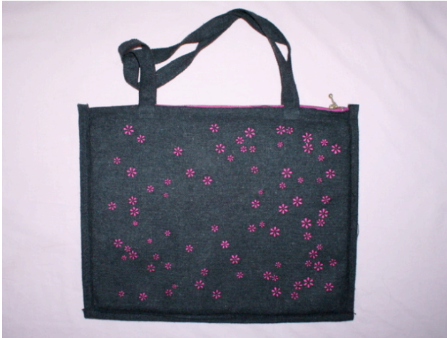
Figure 3. A bag whose flower decoration was produced by cutting a randomized pattern of flower-like shapes into dark wool felt; the pink color derives from the pink backing fabric behind the felt.

case of the bag in Figure 3, a "randomized" pattern of flowers was cut out of wool felt, and a pink backing fabric shows through the cut-out regions. Again, the purpose of this example is to suggest how an opportunity for personalized fabrication can be naturally employed for the sorts of customization that young people might well find motivating.