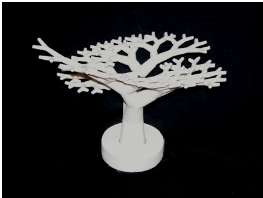
Figure 1. A tangible model of a tree printed with the Growth system.

Figure 1 shows a tree that was designed and printed using the Growth application. The tree has been rendered in plaster (the stand supporting the tree was created separately). Conceivably the tree could now be further decorated (e.g. by painting, or by “dressing” the branches with paper leaves); but in any event, it should be clear that by adding three-dimensional objects to two-dimensional screen renderings, educational computing can take advantage of a powerful new means of “scientific visualization”.