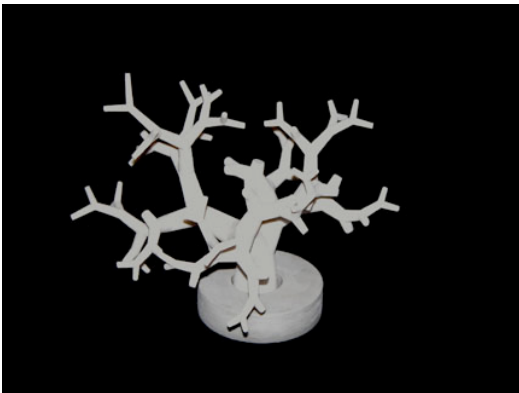
Figures 4 (top) and 5 (bottom): Two more trees designed in Growth and printed out in tangible form.

Space considerations do not permit a thorough discussion of L-systems and their uses; but two additional points deserve mention here. First, virtually any particular L-system (such as the simple one described above) implicitly includes at least several numerical parameters that can be altered to produce varying tree structures. For instance, the L-system of Figure 3 can be “tuned” by setting particular values of the left-turn and right-turn angles; or, alternatively, by allowing each invocation of the STEM rule to set the length of the drawn stem according to the current level of the tree. Thus, even for one particular choice of L-system rules, a wide variety of distinct trees may be drawn. Second, by changing or adding to the rules of the L-system itself, one can generate new “types” of trees. Figures 4 and 5 show trees designed in Growth based on two L-systems (the “Honda” and “Singleton” systems) different from the one shown in Figure 1; these have a substantially different appearance from the type of tree shown in Figure 1.